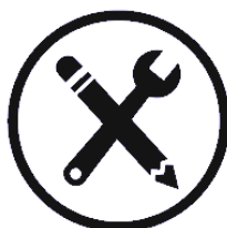
Guidebook for basic skills