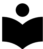
Guidebook for trainers