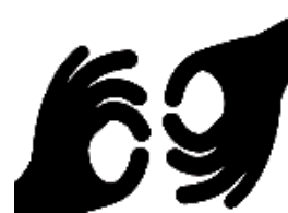
Sign Language Guide