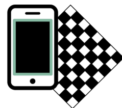
Serious Phygital Game